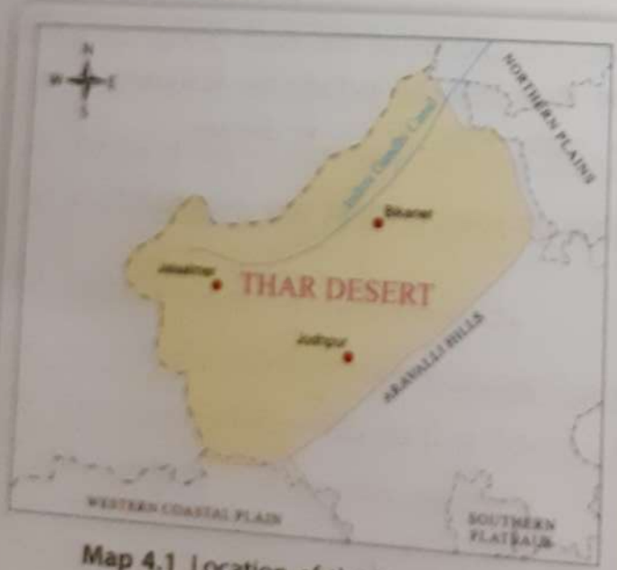
Map 4.1 Location of the Thar Desert

The Thar Desert is covered with a thick sheet of loose sand. At some places, there are small hills of sand called sand dunes. Sometimes strong winds which blow here carry a large amount of sand with them. They call