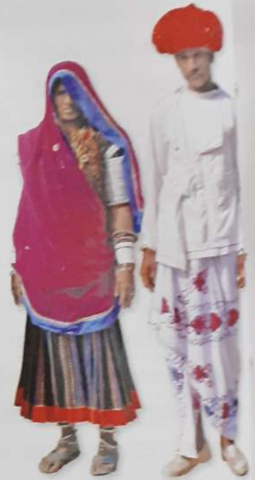
People of Rajasthan wear colourful clothes.

Women in villages wear ghaghra, choli and odhni. Men wear dhoti, kurta and turban. People love to eat dal-baati-choorma . They celebrate Gangaur and Teej . Ghoomar and Kalbeliya are popular folk dances.